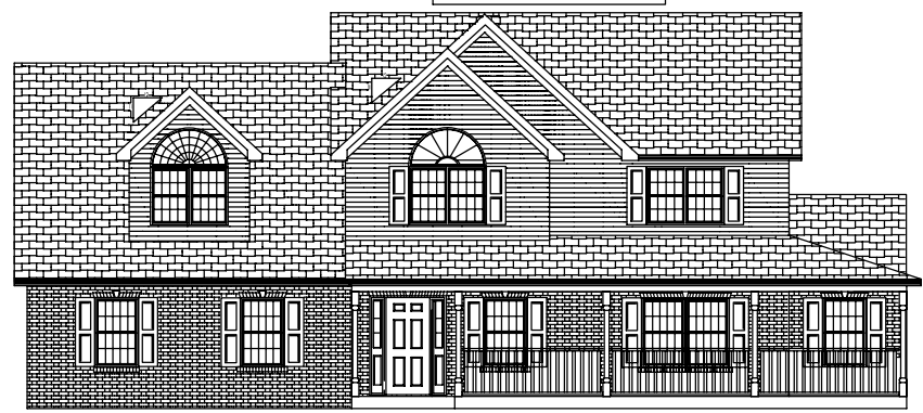
ARCHITECTURAL DETAILS OPTIONAL