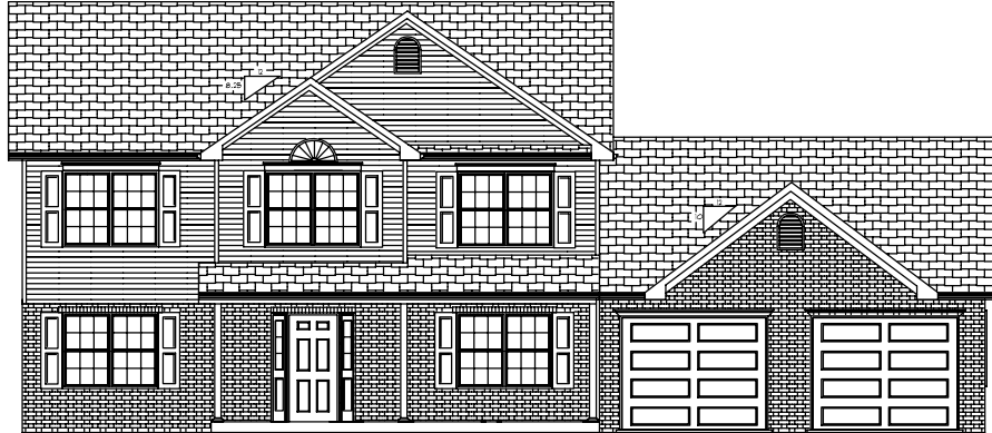
ARCHITECTURAL DETAILS 6 OPTIONAL