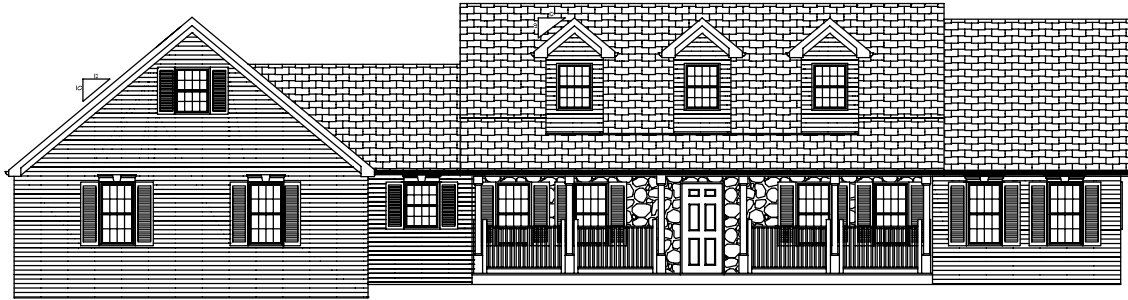
ARCHITECTURAL DETAILS OPTIONAL